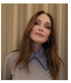
The Redheads are above & below the Brunettes! Remember, this is to give you an idea of type -please stay within the ethnicity of the requested submission instructions, thank you CSA CD SW